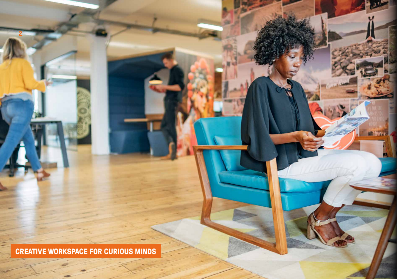
CREATIVE WORKSPACE FOR CURIOUS MINDS