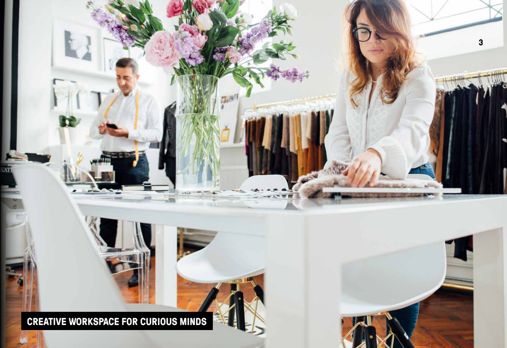
CREATIVE WORKSPACE FOR CURIOUS MINDS